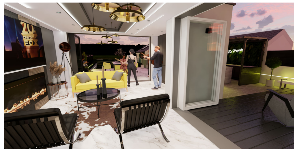
Internal View 3

New opening to be formed in hallway wall to allow for new GF shower room to be formed under stairs. Extract to be ducted to outside under suspended floor.