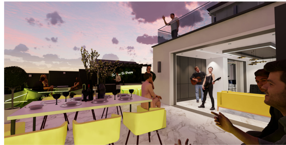
External View 2