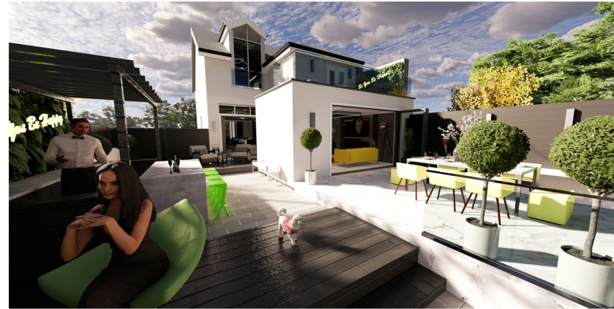
External View 1